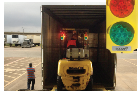
i-stop is needed to prevent accident like this one